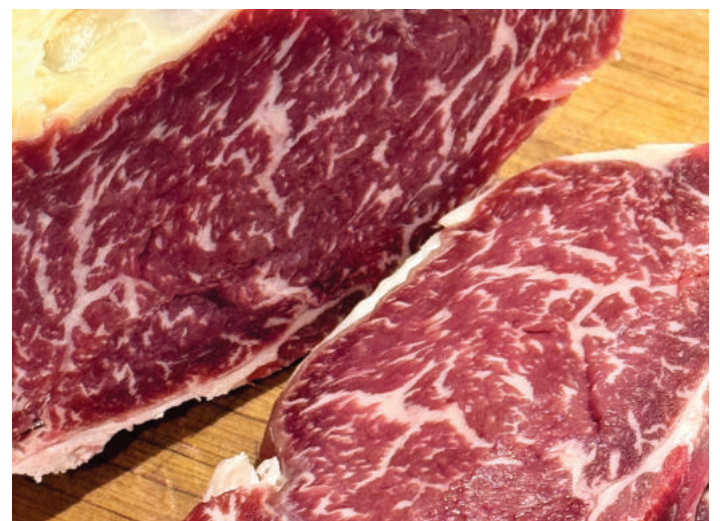
2yo 100% grassfed JAD Speckle Park heifer.

Our goal as beef producers should always be to provide the beef consumer with a consistently outstanding eating experience. Speckle Park delivers on this, and it’s good for you too! Meat research conducted by JAD Speckle Park at the University of Newcastle in 2023 demonstrated the low fat melting point of Speckle Park beef together with high levels of omega-3 fatty acids – 11 animals out of 50 achieved “source” levels (30mg/100g tissue) – extremely rare in beef cattle. All of this contributes to the superior eating experience of Speckle Park beef – it’s so flavoursome, soft and succulent. For gourmet beef without the burden of a lengthy feeding regime, choose Speckle Park.